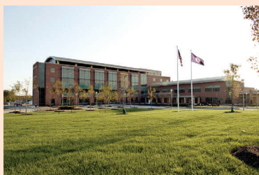
Stafford Hospital Center

Please go to www.varehabnurse.org for additional registration forms